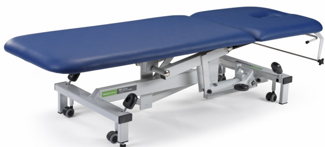
Couch at minimum height with optional paper roll holder

EMS Physio Ltd order codes COU001 Hydraulic with breathing slot COU002 Electric with breathing slot