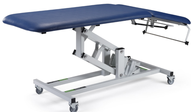
Couch with backrest negative and optional paper roll holder