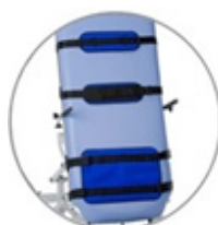
Spare Harness Set