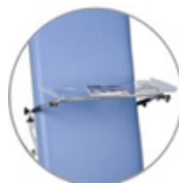
Perspex Patient Table