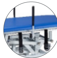
Patient Hand Grips