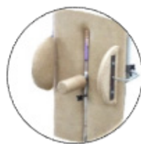
Divided Leg with Pommel