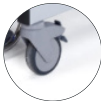
Large Braked Wheels