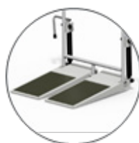
Divided Foot Board